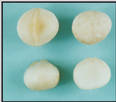
large kernels of good appearance

KERNEL QUALITY Av kernel mass: 2.8 - 3.4g Av kernel %: 35.9 - 43.6% % No.1 kernel: 55.6 - 96.5% Whole kernel: 31 - 76%