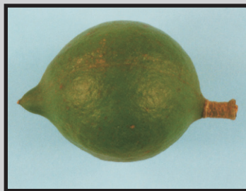
neck present long, sharp apical point in line with thin stalk